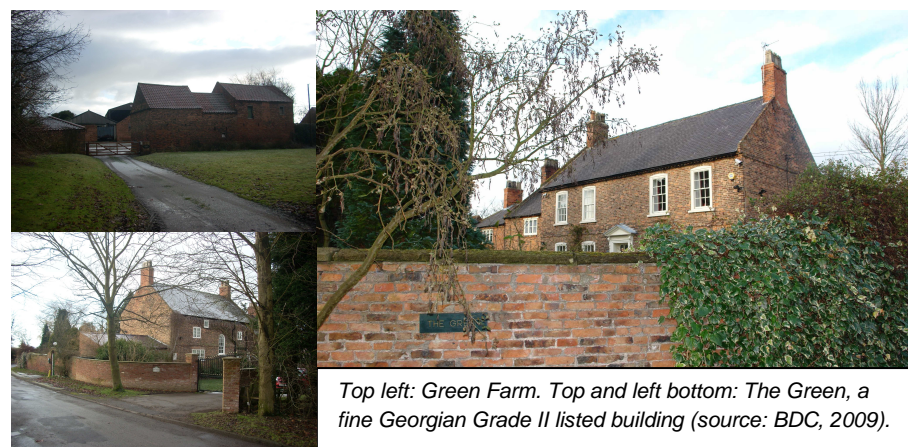
Top left: Green Farm. Top and left bottom: The Green, a fine Georgian Grade II listed building.

Overall, the Gringley extension includes further areas of special architectural and historic interest.