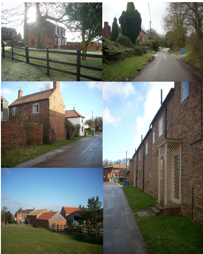
Clockwise from top left: Beacon House; Low Street; Appleton House Farm; views along Finkell Street (both images).

The village of Gringley on the Hill is situated 6 miles north of Retford on a high ridge overlooking the low-lying Carr to the north and the River Idle to the south, which provides superb views in every direction. Gringley is mentioned in the Domesday Book.