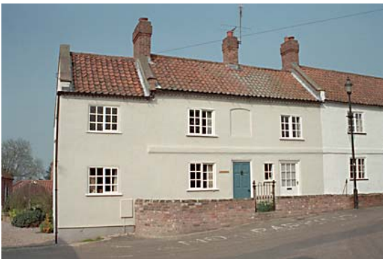
Everton has a strong architectural and historic character.

Their designation is about recognising the significance of an area and about managing its future. Designation is not intended to prevent change or adaptation but simply to ensure that any proposals for change are properly considered, and those qualities that give it its special character are sustained.