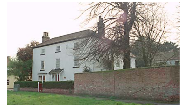
The Bawtry Rd crossroads are characterised by late 18 th century buildings, notably Davenport House and Corner Farm.

Gainsborough/ Bawtry Road is a distinct character area. The historic roadway dominates, but is interspersed with clusters of close-knit farmsteads, houses and cottages with positive spaces between them, which retain a close relationship with the rural countryside.