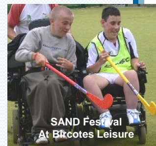
SAND Festival At Bircotes Leisure