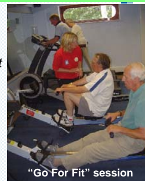
"Go For Fit" session