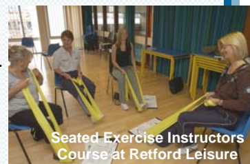
Seated Exercise Instructors Course at Retford Leisure