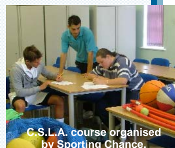
C.S.L.A. course organised by Sporting Chance.