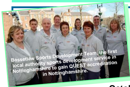
Bassetlaw Sports Development Team, the first local authority sports development service in Nottinghamshire to gain QUEST accreditation in Nottinghamshire.

In October 2005 the service maintained its QUEST Accredited status, achieving a credible 8% improved overall score from the score received in