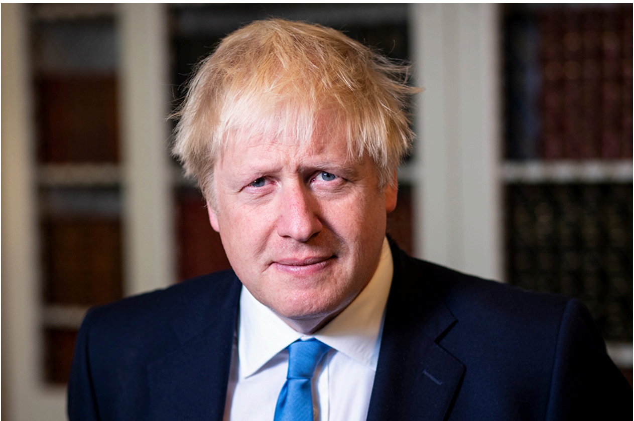
The Rt Hon Boris Johnson MP, Prime Minister