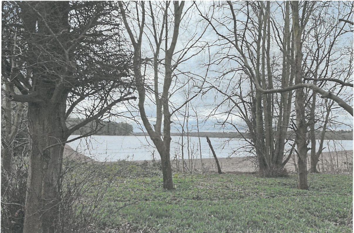
Site Photograph No.3 – Above: site photo showing the south-western aspect of the proposal site, taken from the eastern aspect of the adjacent thoroughfare of the A614;