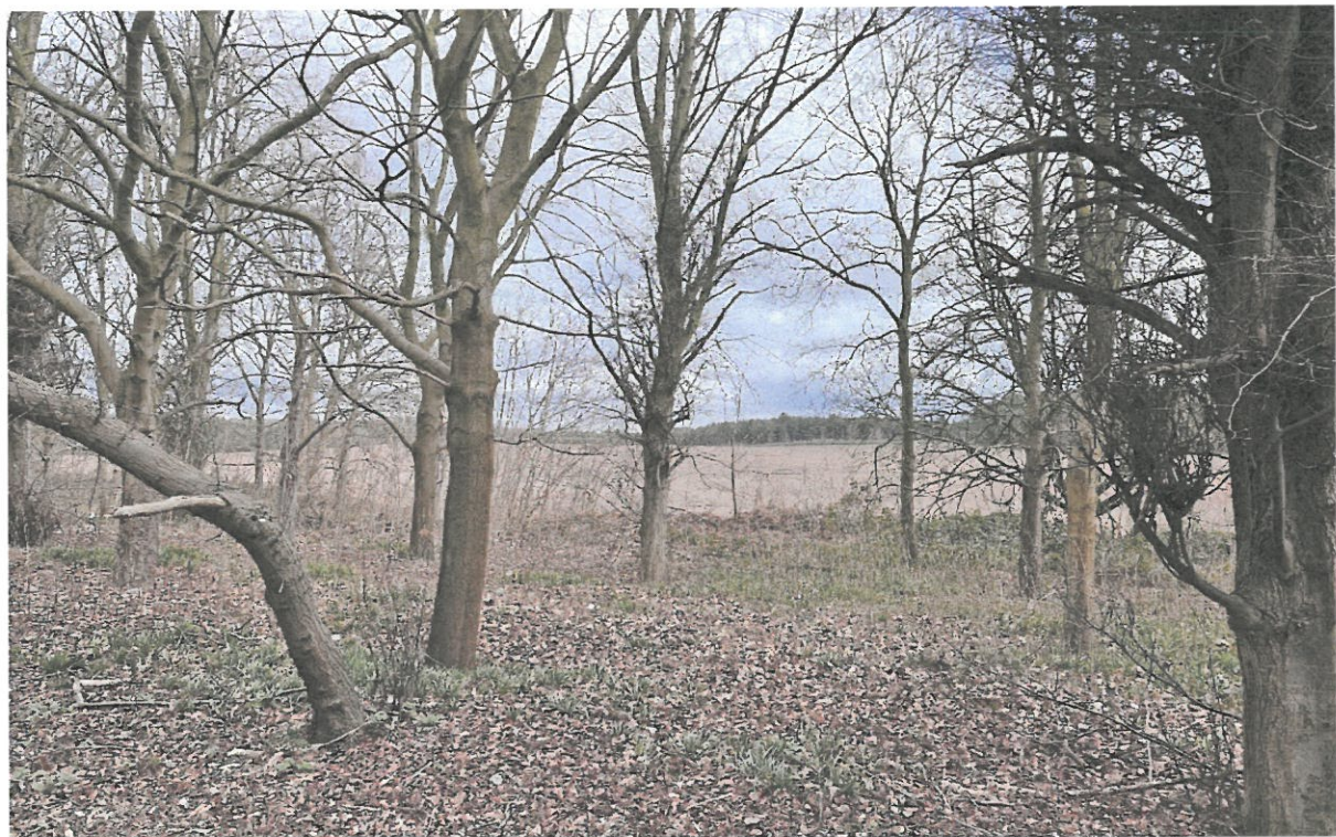
Site Photograph No.6 – Above: site photo showing the western aspect of the proposal site, taken from the eastern aspect of the adjacent thoroughfare of the A614;