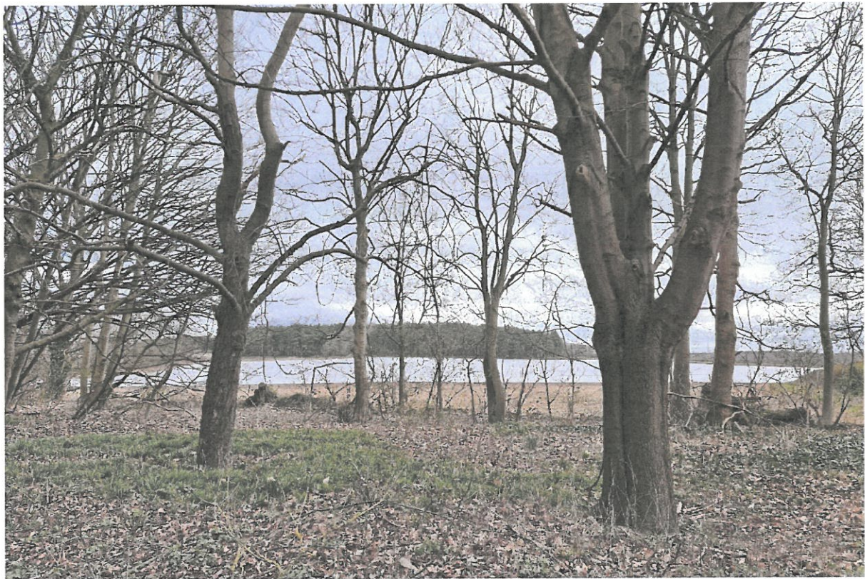
Site Photograph No.2 – Above: site photo showing the south-western aspect of the proposal site, taken from the eastern aspect of the adjacent thoroughfare of the A614;