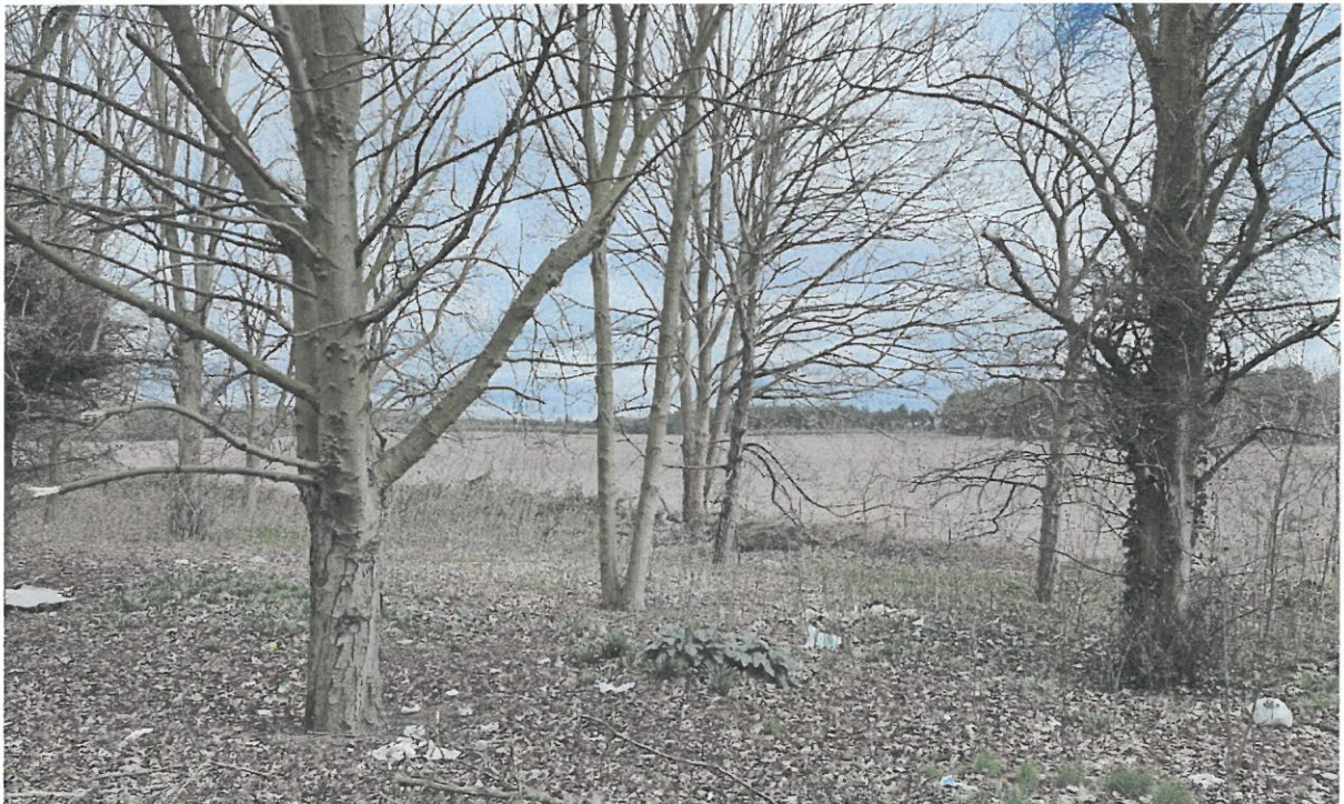
Site Photograph No.8 – Above: site photo showing the western aspect of the proposal site, taken from the eastern aspect of the adjacent thoroughfare of the A614;