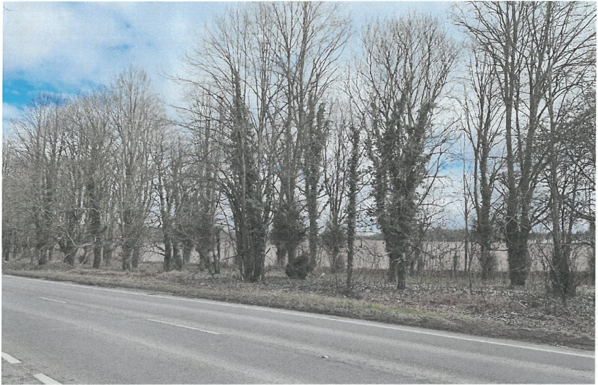
Site Photograph No.11 – Above: site photo showing the north-western aspect of the proposal site, taken from the western aspect of the adjacent thoroughfare of the A614;