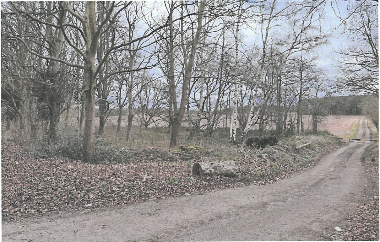
Site Photograph No.5 – Above: site photo showing the western aspect of the proposal site, taken from the eastern aspect of the adjacent thoroughfare of the A614;