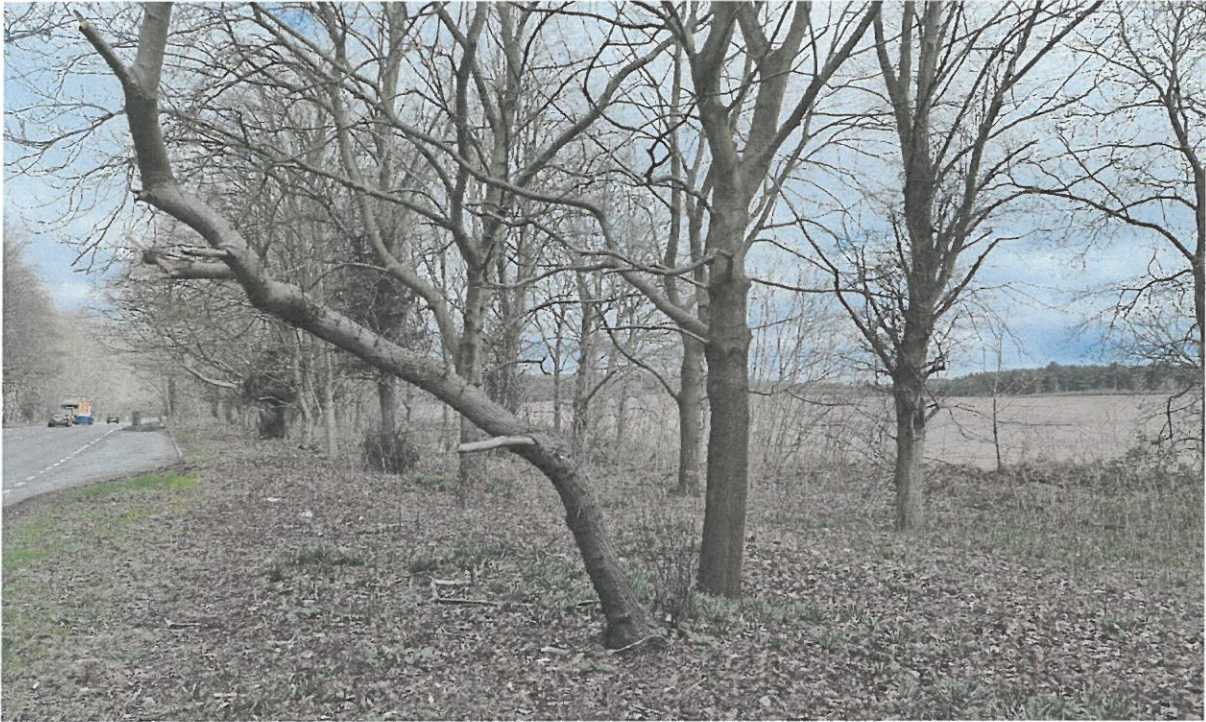
Site Photograph No.7 – Above: site photo showing the western aspect of the proposal site, taken from the eastern aspect of the adjacent thoroughfare of the A614;