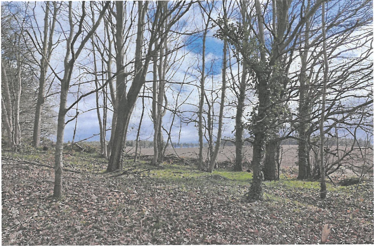
Site Photograph No. 13 – Above: site photo showing the north-western aspect of the proposal site, taken from the eastern aspect of the adjacent thoroughfare of the A614;