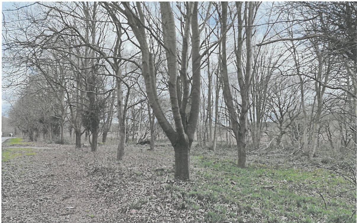
Site Photograph No.4 – Site photo showing the western aspect of the proposal site, taken from the eastern aspect of the adjacent thoroughfare of the A614;