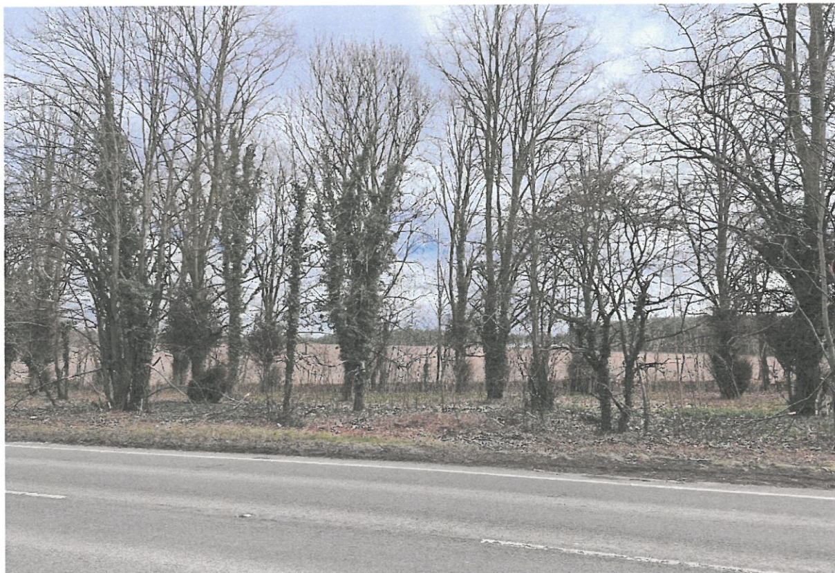
Site Photograph No.10 – Above: site photo showing the north-western aspect of the proposal site, taken from the western aspect of the adjacent thoroughfare of the A614;