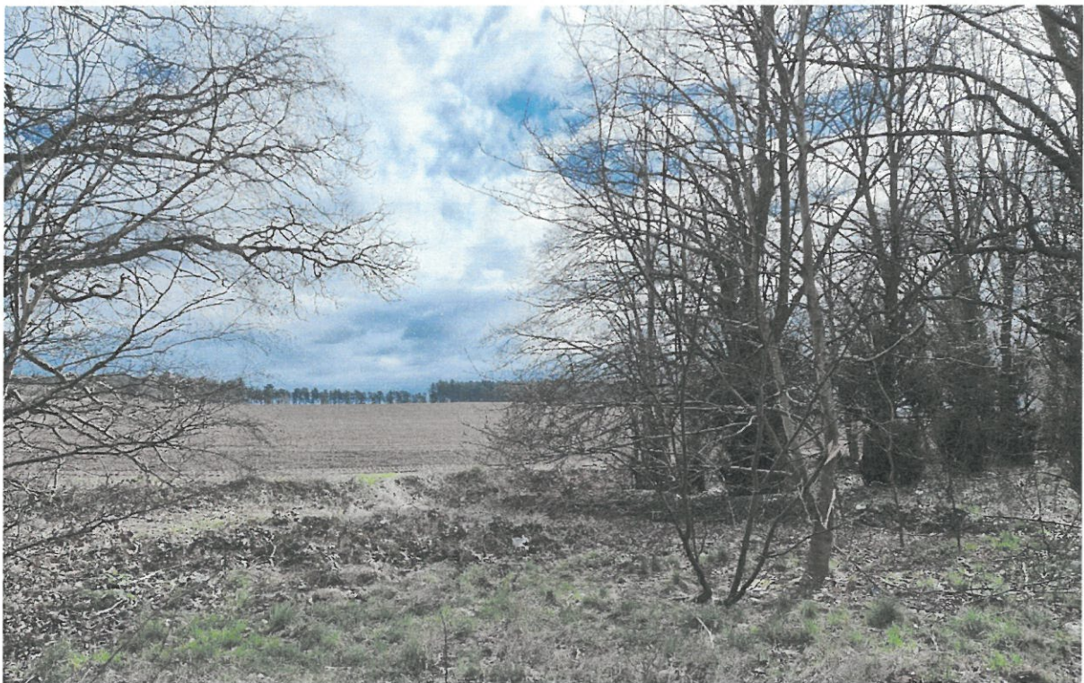
Site Photograph No.12 – Above: site photo showing the north-western aspect of the proposal site, taken from the eastern aspect of the adjacent thoroughfare of the A614;