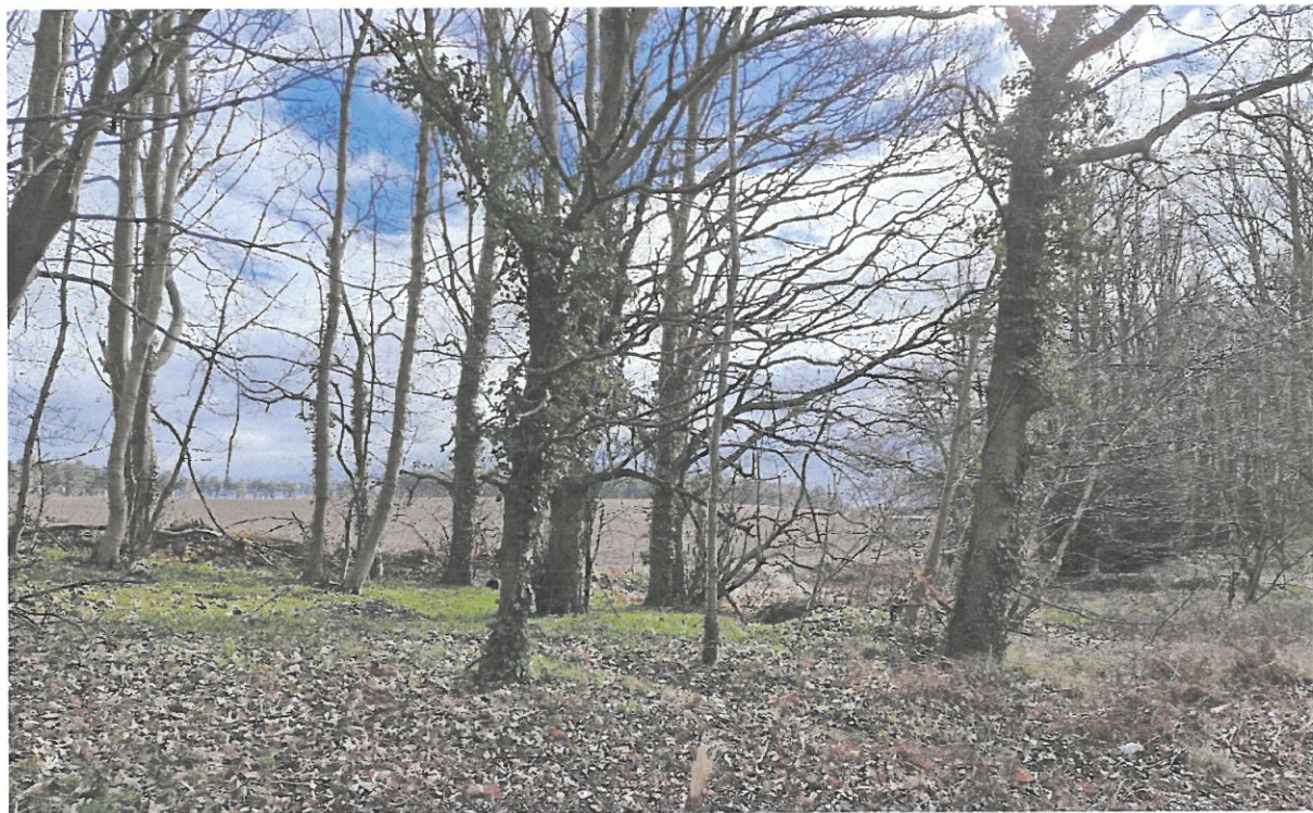
Site Photograph No. 14 – Above: site photo showing the north-western aspect of the proposal site, taken from the eastern aspect of the adjacent thoroughfare of the A614;