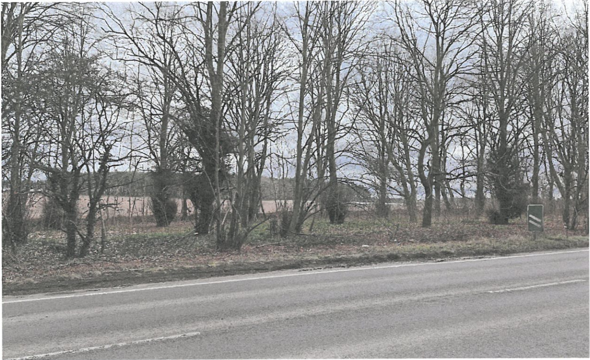
Site Photograph No.9 – Above: site photo showing the western aspect of the proposal site, taken from the western aspect of the adjacent thoroughfare of the A614;