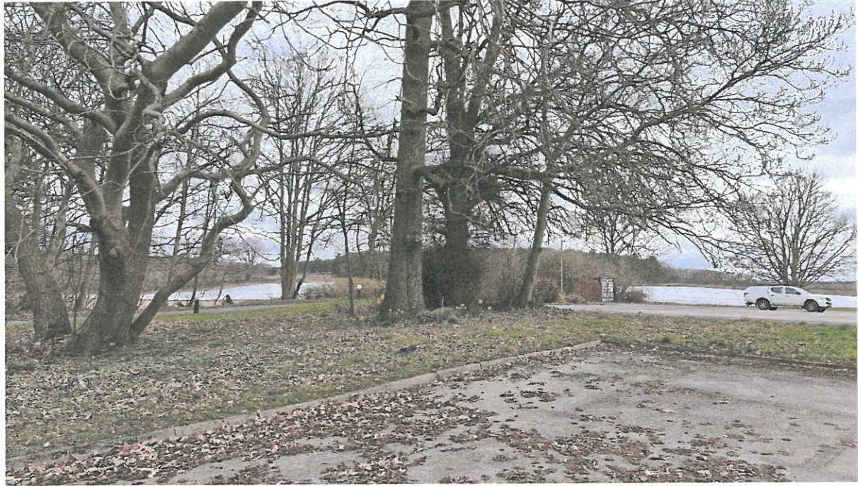
Site Photograph No.1 – Above: site photo showing the south-western aspect of the proposal site, taken from the northern aspect of the adjacent car park of the 'Clumber Park Hotel and Spa';