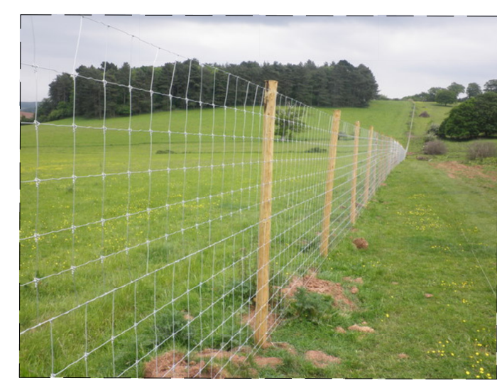
DEER FENCE-ILLUSTRATIVE IMAGE