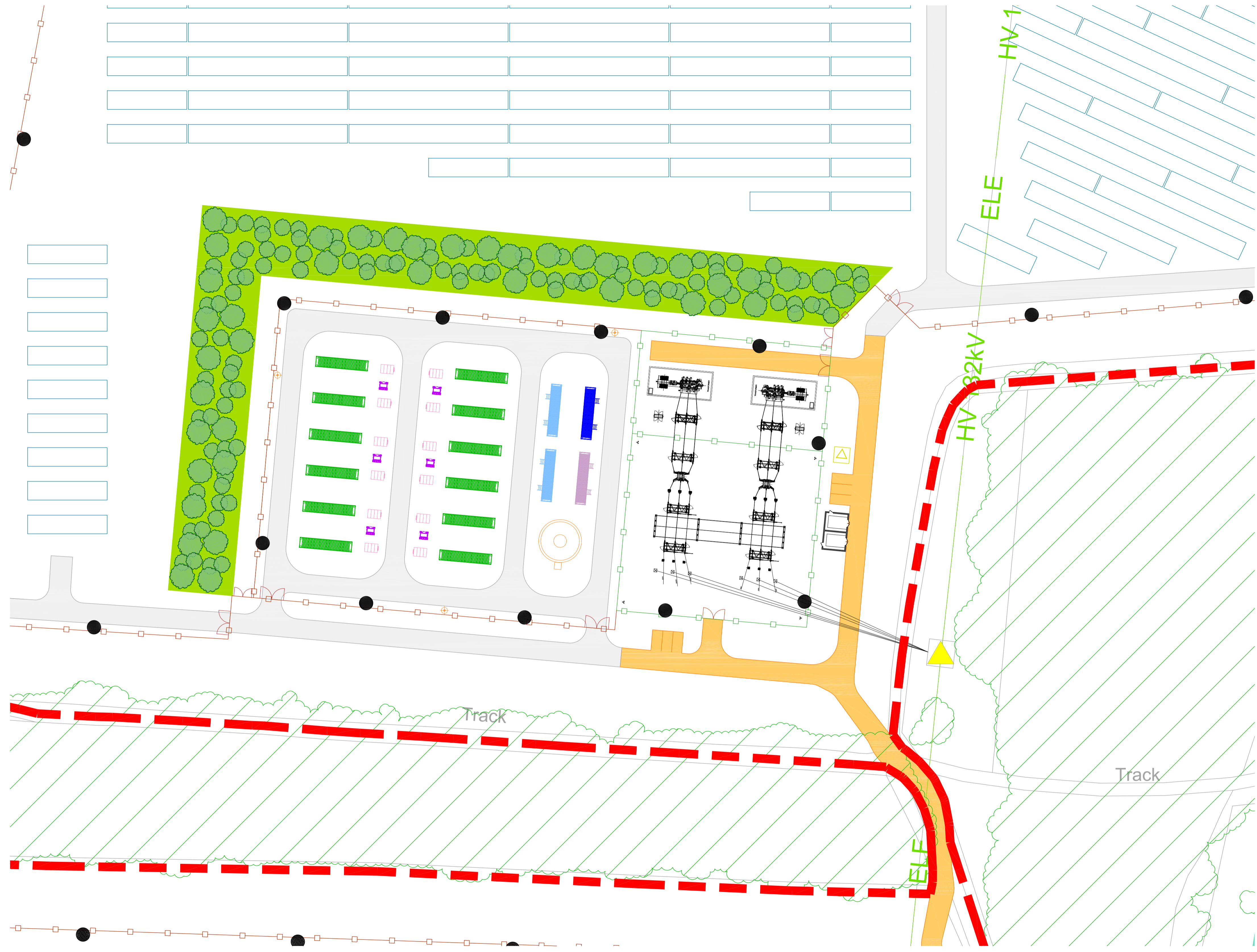
1 NORMANTON LARCHES BESS LAYOUT PLAN Scale: 1:500@A1